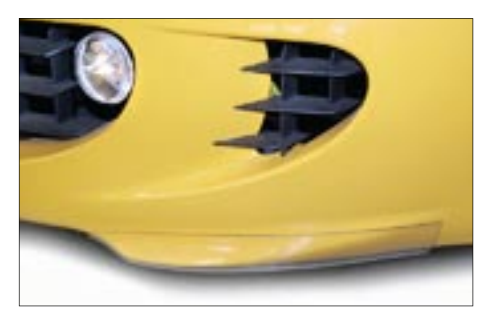
LOTAC05361: Chin guards.