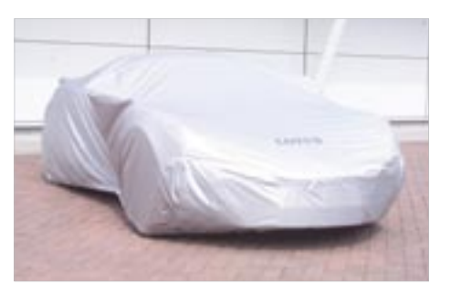
LOTAC05319: Shower Cover, a full car cover for short-term wet weather protection.