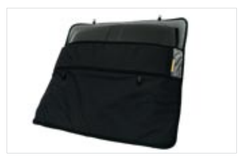
LOTAC05316: Hard Top Stowage Bag, an ideal way of protecting your Elise hard top when not fitted to the car.