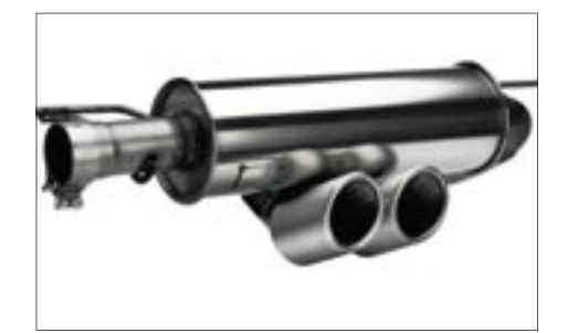
LOTAC05335 (Elise R), LOTAC05391 (Elise S): Level 2 Sports Exhaust. A compact silencer which offers further visual styling and a greater sound enhancement. For track use only