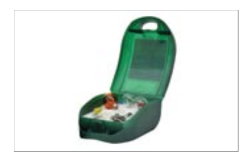
LOTAC05345: Universal bulb and fuse set for travel in the EU.