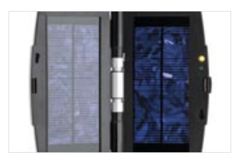
LOTAC05325: Solar Trickle Charger to use with all cars.