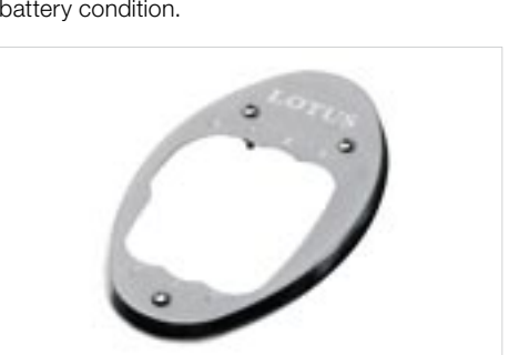
LOTAC05358: Gear lever gate. Elise R only.