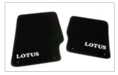
LOTAC05351(LHD)/LOTAC05350(RHD): Embroidered over Footmats Elise 6-speed.