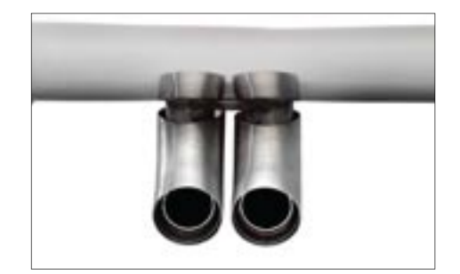
LOTAC05334 (Elise R): Level 1 Sports Exhaust. A compact silencer which offers visual and sound enhancement over the standard unit. For track use only