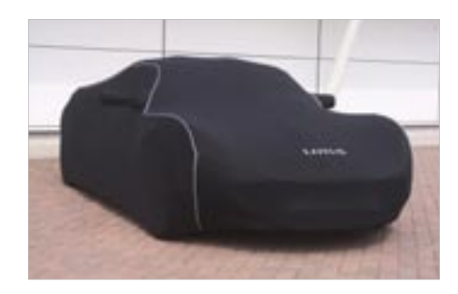
LOTAC05317: Dust Cover, fully fitted dust cover for all Series 2 Elise and suitable for in-door storage protection.