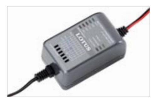
LOTAC05139: Battery Trickle Charger/ Conditioner, is ideally suited for low usage vehicles. Will help prolong and maintain battery condition.